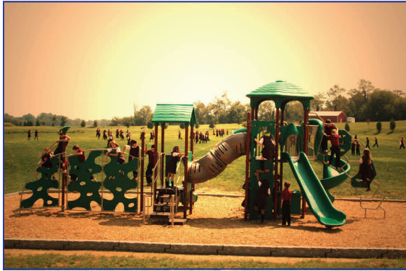
"The Future Starts Today, not Tomorrow" Blessed Pope John Paul II